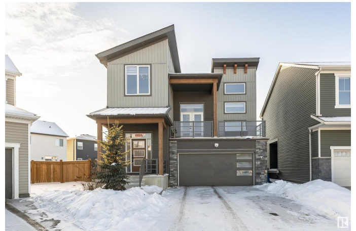
1603 202 St NW, Edmonton, AB