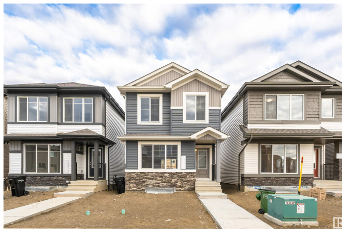
9566 Carson Bnd SW, Edmonton, AB

Main Floor Exterior Area 65.32 m 2 Interior Area 59.37 m 2